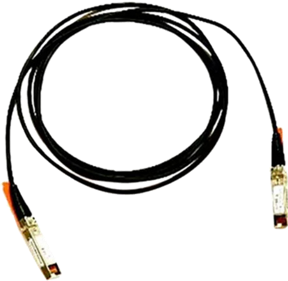
Figure 4. Cisco direct-attach twinax copper cable assembly with SFP+ connectors

Cisco SFP+ Copper Twinax (Figure 4) direct-attach cables are suitable for very short distances and offer a cost-effective way to connect within racks and across adjacent racks. Cisco offers passive Twinax cables in lengths of 1, 1.5, 2, 2.5, 3, 4 and 5 meters, and active Twinax cables in lengths of 7 and 10 meters.