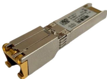
Figure 2. Cisco SFP+ 10GBASE-T module with RJ-45 connector

The Cisco 10GBASE-T module (Figure 2) offers connectivity options at the following data rates: 100M/1G/10Gbps. It has the SFP+ form factor and an RJ-45 interface so that CAT5e/CAT6A/CAT7 cables can be used to connect to end points with embedded 10GBASE-T ports. They are suitable for distances up to 30 meters and offers a cost-effective way to connect within racks and across adjacent racks.